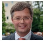
prof. dr. Jan Peter Balkenende, staatsm.