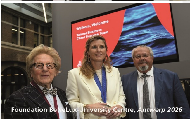
Foundation BeNeLux-University Centre, Antwerp 2026