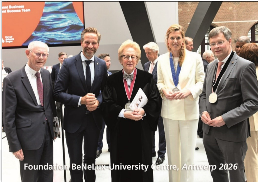
Foundation BeNeLux-University Centre, Antwerp 2026