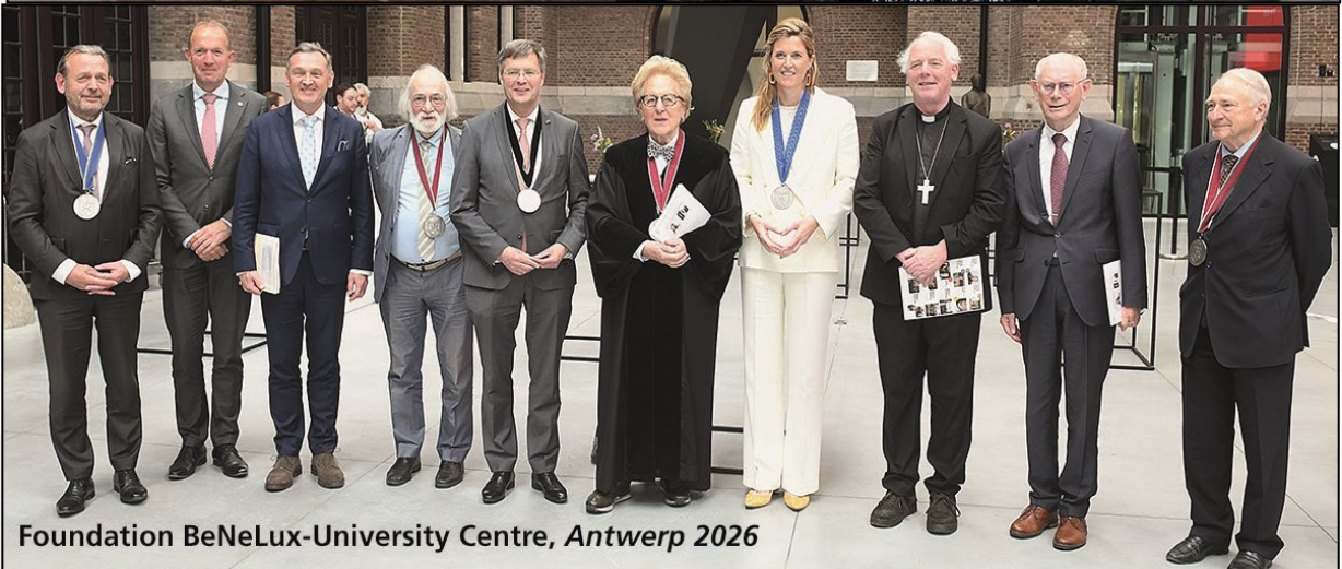
Foundation BeNeLux-University Centre, Antwerp 2026