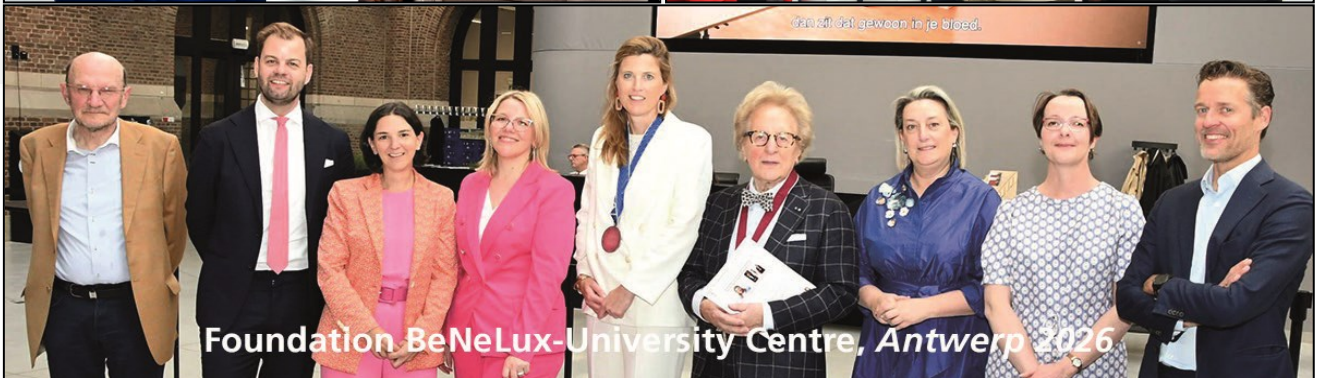
Foundation BeNeLux-University Centre, Antwerp 2026