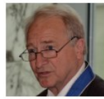
prins Charles-Louis de Merode, raadsh.