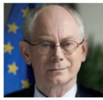
prof. dr. Herman graaf Van Rompuy